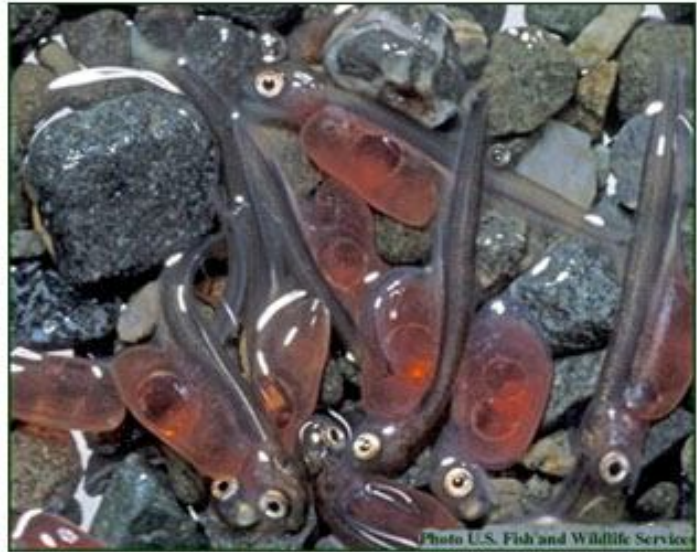
Just hatched salmon alevins with yolk sacs.

Both the male and female salmon die within a few days after spawning. Their decomposing bodies provide a rich supply of nutrients for fish and animals, such as bears, eagles, wolves and ravens. Salmon carcasses get