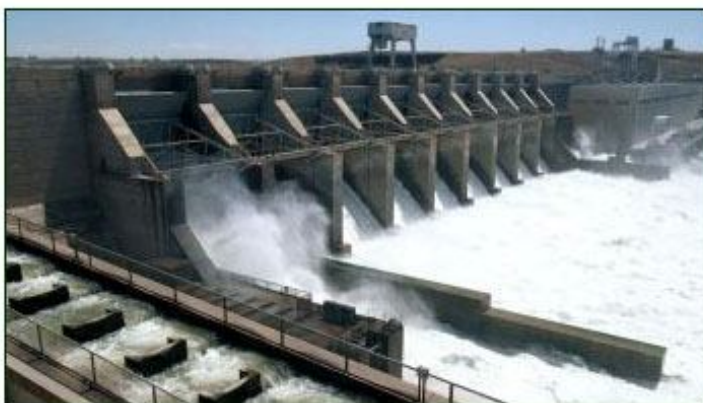
Ice Harbor Dam on the Snake River in Burbank, Wash.

Some dams have fish ladders, which look like watery stair steps, that help the salmon pass by the dam. But the salmon may use up their stored energy trying to make their way past dam after dam.